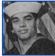
Warren Joseph Torregano U.S. Navy Vietnam War