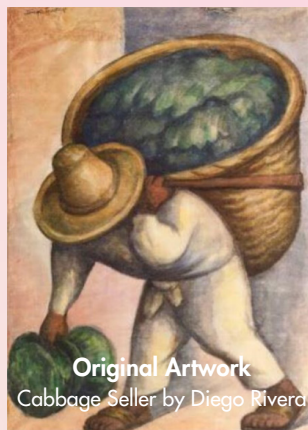
Original Artwork Cabbage Seller by Diego Rivera

To view all submissions, visit this photo album . To view the contest winners, view this flyer .